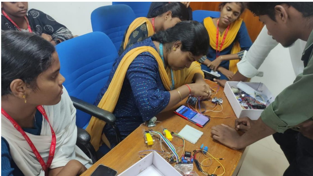
Pic 4 : Students made their own project