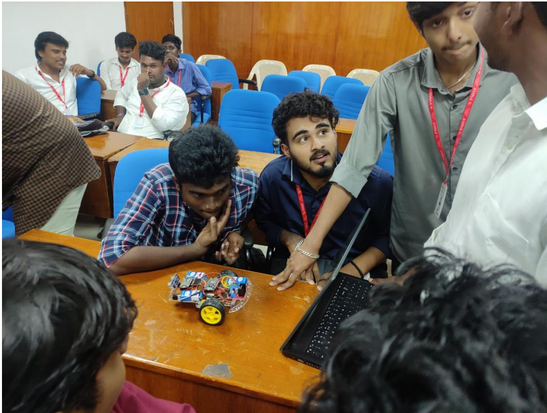
Pic 3: Students Involved in Hands-on training