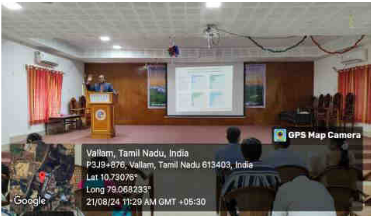
The resource person explained how GDP is calculated and the factors that influence its growth