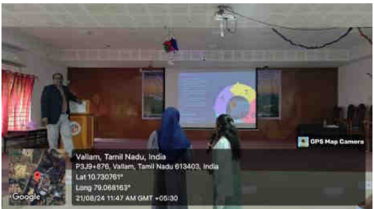
Mr.N.Balamurugan providing practical examples of how students could apply SWOT analysis to their personal and professional lives