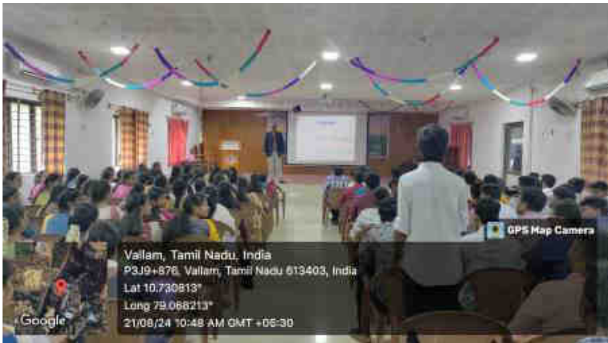
Question and Answer session with students