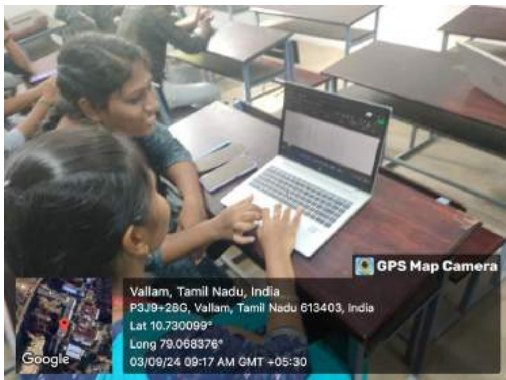
Students gaining hands on training in MS Excel