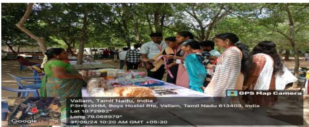
gs profit and how to interact an entrepreneurs