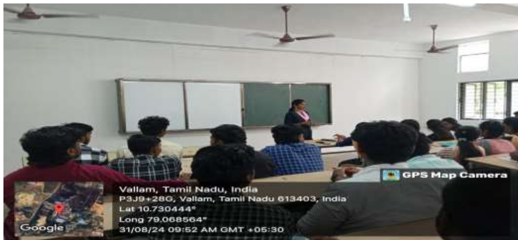
Ms.K.Padmini providing practical examples of how students could apply SWOT analysis to their personal and professional lives