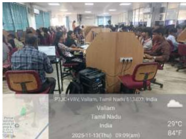
Practical Exposure on Value Added Course