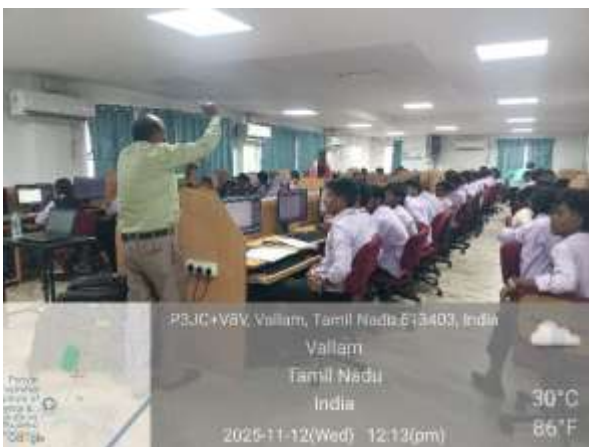
Practical Exposure on Value Added Course