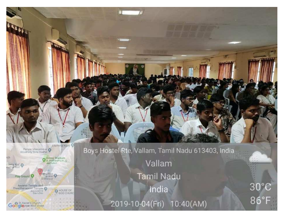
Student participation in the awareness campaign