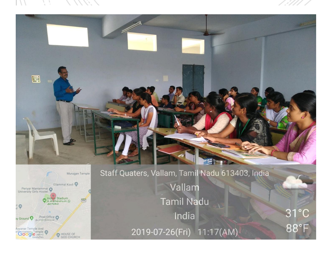
Totally 51 Students from III B.Com (Hons) attended the interactive session.

Professor (Agrl.Economics) Department of Social Sciences, HC&RI (W), Trichy,