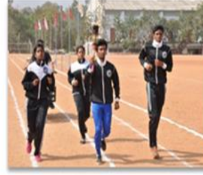
Athletics Track – 400 mts