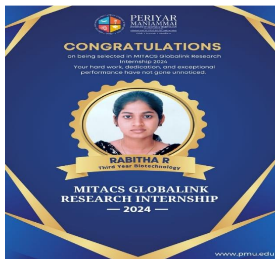
Research Internship at MacEwan University -Canada