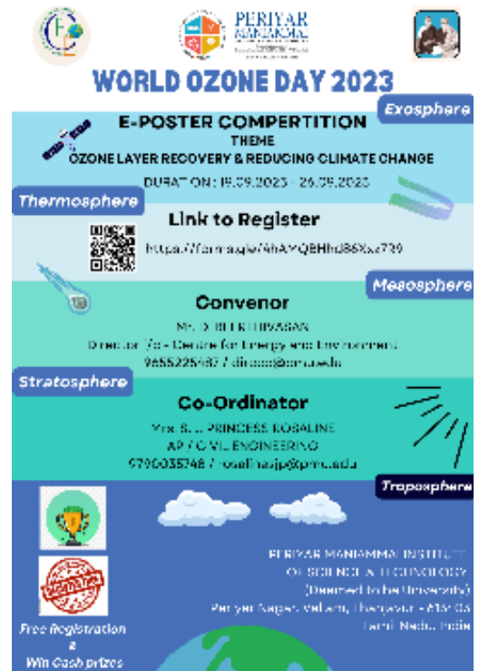
Ozone Day Awareness