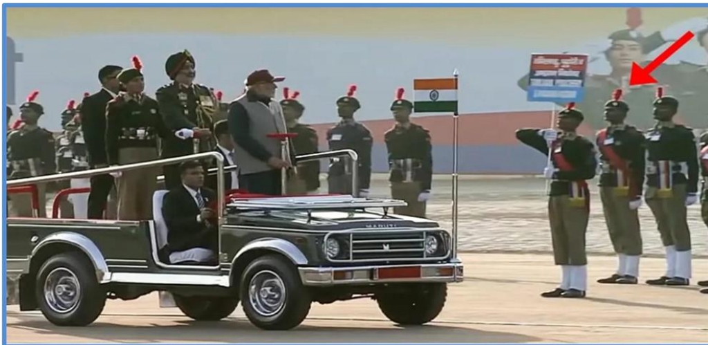
Prime Minister's Rally 2024