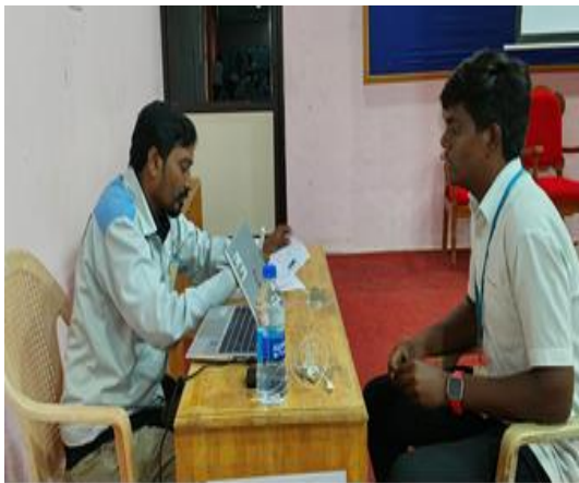
DAIKIN Air Conditioning