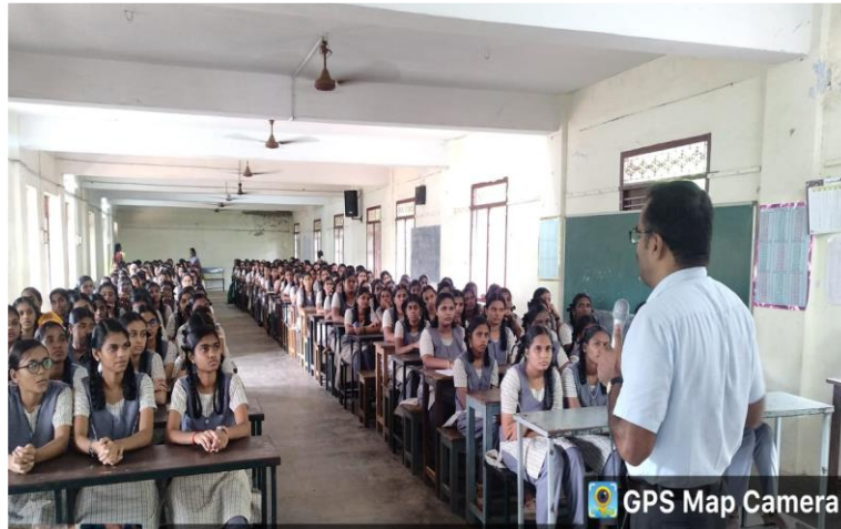
Cyber Security Awareness Programme