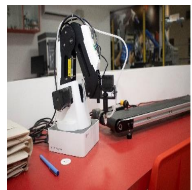
IoT based Face masking