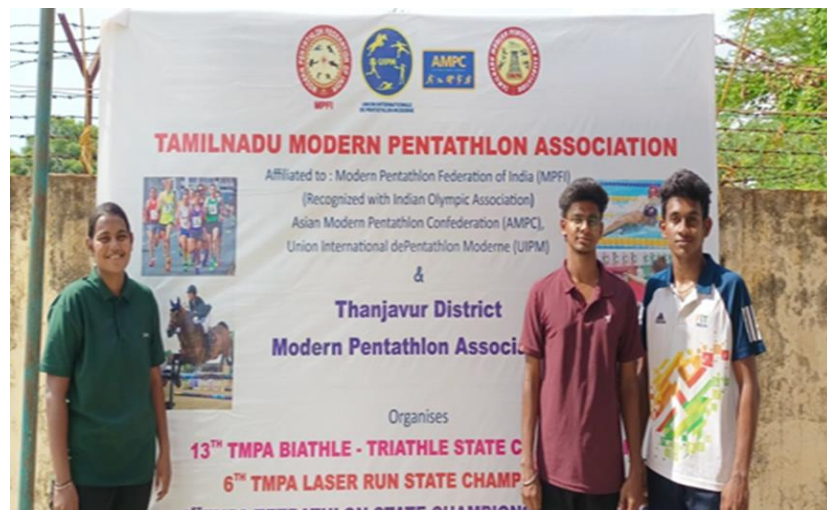
TMPA State Championship 2023