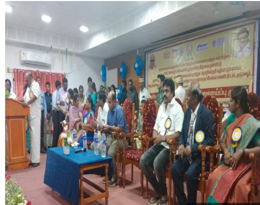
Offer Letter Issued