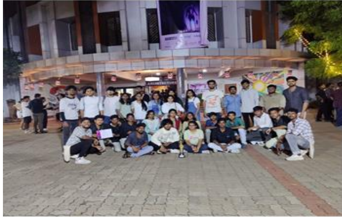
Overall Trophy won at Symposium – Department of Architecture