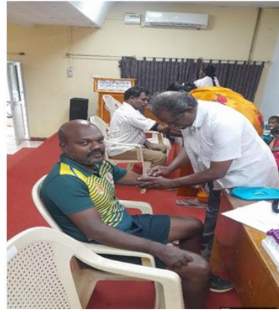
Blood Analysis Camp