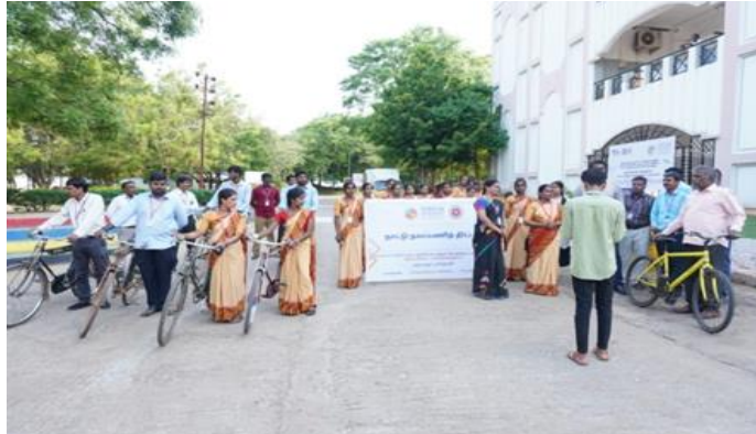
World Bicycle Day