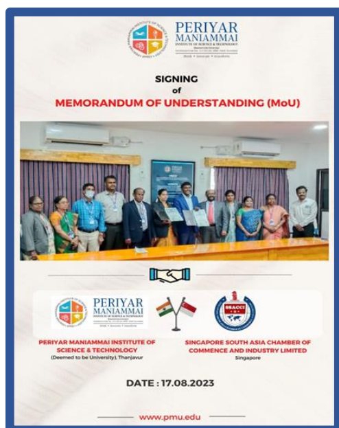
Singapore South Asia Chamber of Commerce & Industry

• 32 MoUs have been signed with Industries and Institutions To name a few, we have signed an MoU with Tamilnadu Forest Department of Thanjavur Division, State Human Rights Commission (Tamil Nadu), Taylor's University, Malaysia, Singapore South Asia Chamber of Commerce and Industry, Singapore.