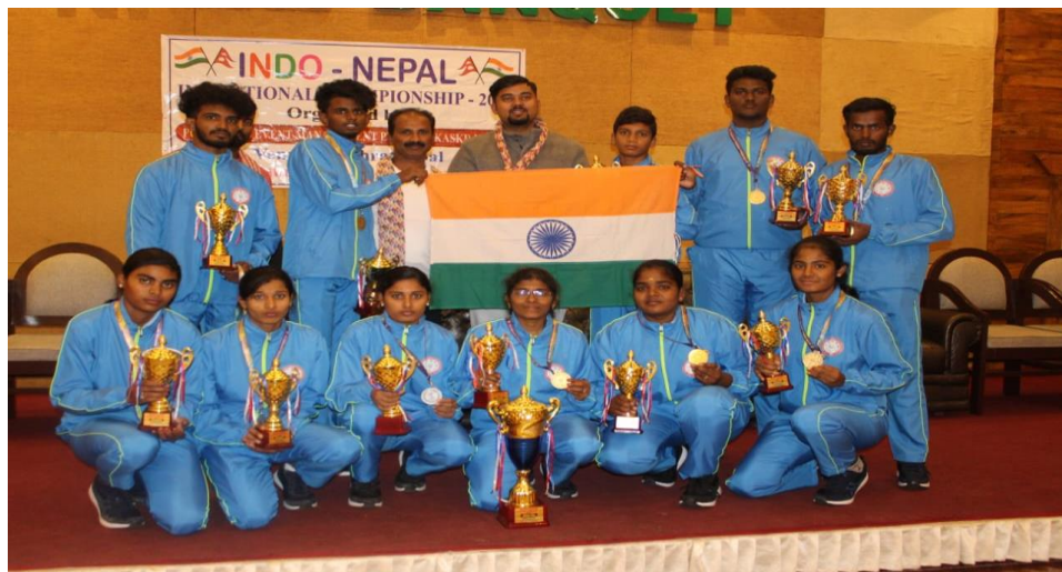
Indo-Nepal invitational championship 2024