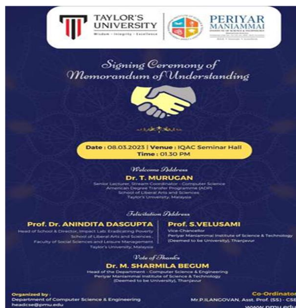
Taylor's University, Malaysia