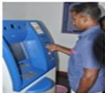
Bank with ATM