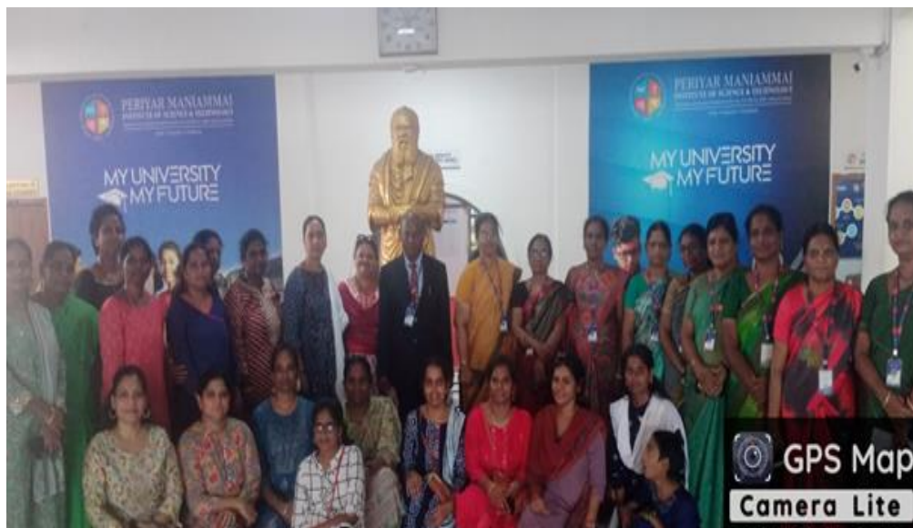
Alumni (Batch: 1996-2000) Get-Together

On behalf of our Alumni association, we have organized 21 Alumni Meetings ; Conducted 20 Alumni Lecture Series and arranged 1 Silver Jubilee Reunion