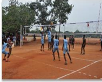
Volley Ball Court