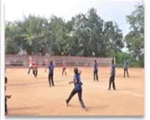
Ball Badminton Court