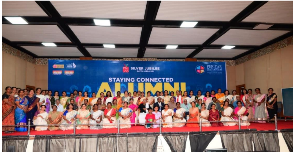
Silver Jubilee Reunion of Batch 1994 –1998