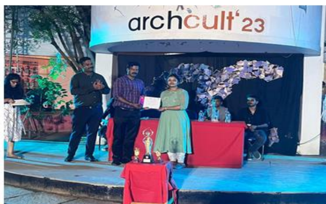
MoU with Monolith Research and Training