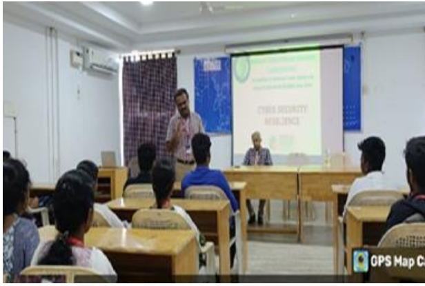
Police cyber club