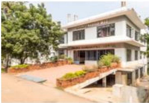
Swarna Ranganathan Hostel