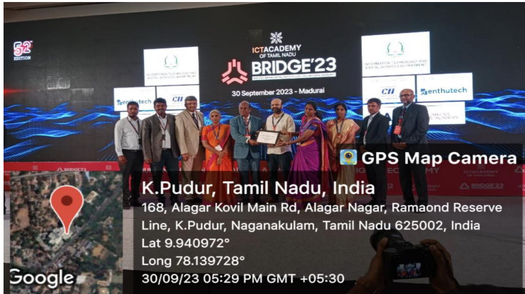
Centre of Excellence in ICT Academy