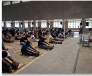
Hall for Yoga Practice