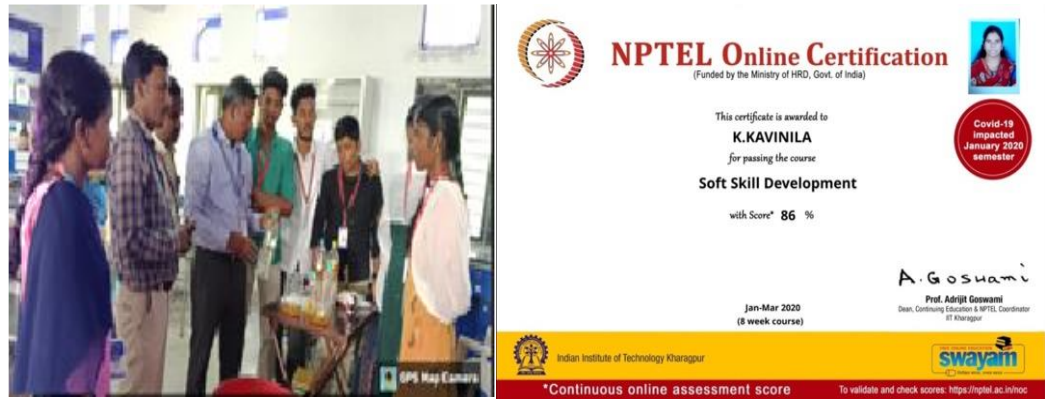
Value Added Courses and Online Courses